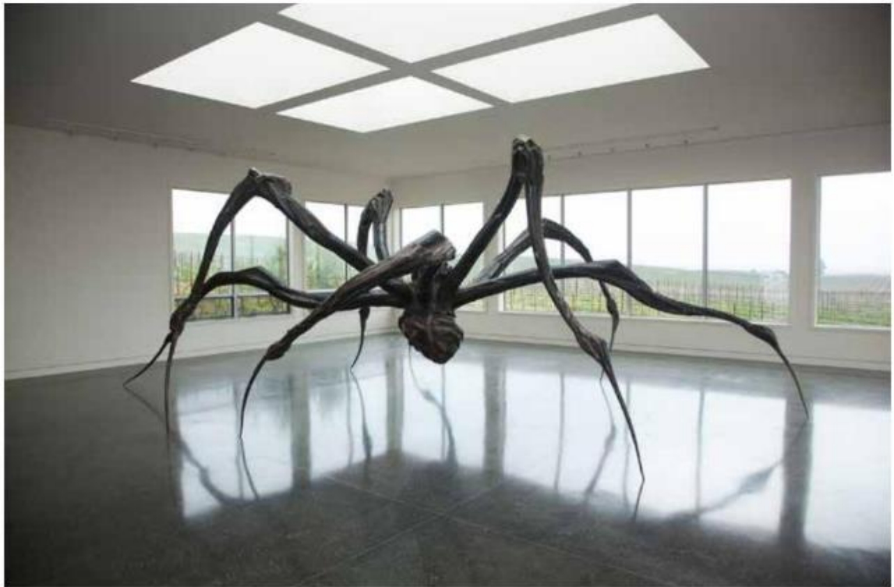
Louise Bourgeois - Crouching Spider 2003