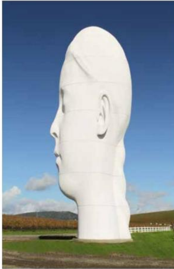
Jaume Plensa - Sanna 2015