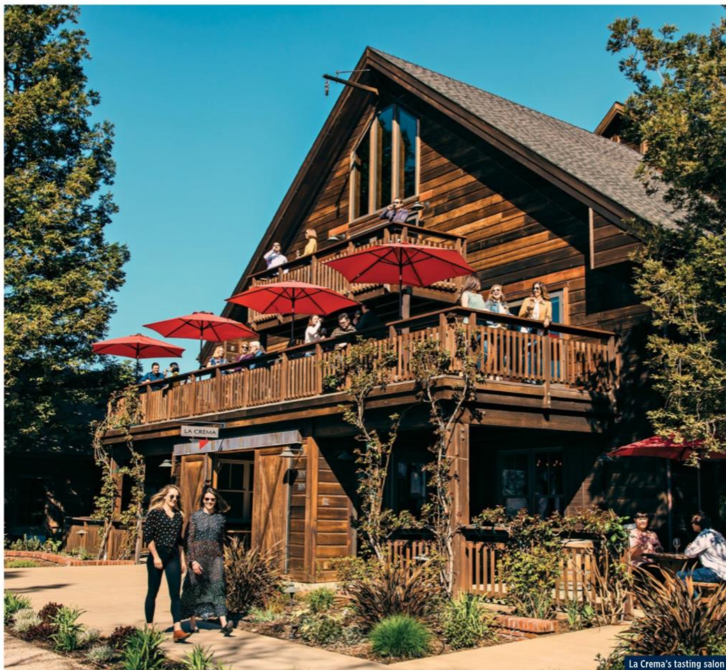
La Crema's tasting salon