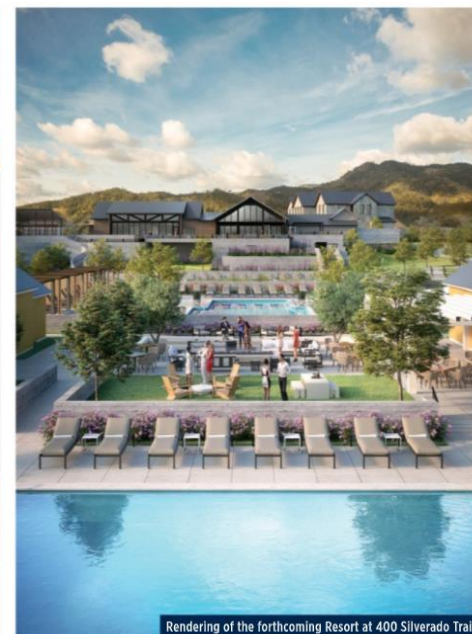
Rendering of the forthcoming Resort at 400 Silverado Trail