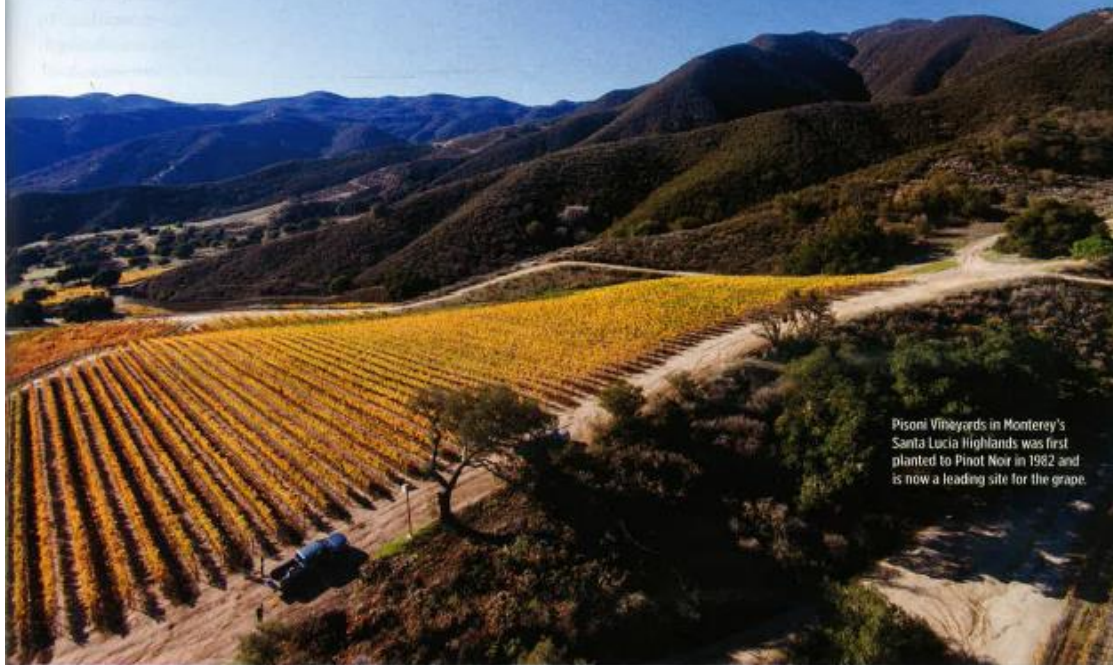
Pisoni Vineyards in Monterey's Santa Lucia Highlands was first planted to Pinot Noir in 1982 and is now a leading site for the grape.

California Pinot Noir is enjoying a harmonic convergence. Everything seems to be going its way as it builds on a decade of consistent success.