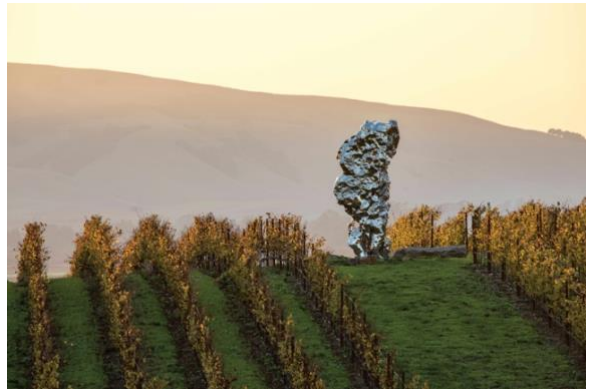
Zhan Wang, Artificial Rock No. 126, 2007–13