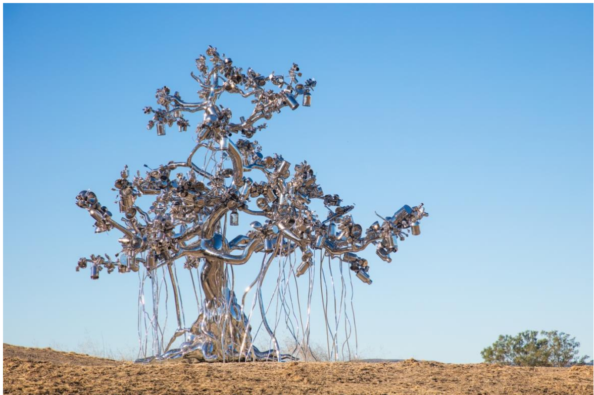
Subodh Gupta, People Tree, 2017

Inaugural Blanc de Blancs to Commemorate 20th Anniversary. Featuring Subodh Gupta art label