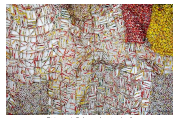
El Anatsui, Rehearsal, 2015, detail