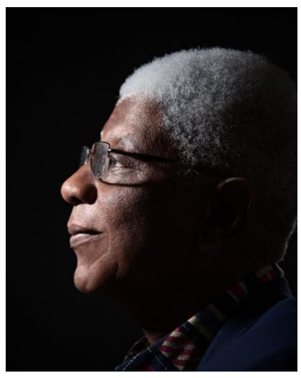
El Anatsui. 2019

SONOMA, California (14 December 2021): Donum, one of the leading California Pinot Noir producers, has installed Rehearsal , a monumental wall hanging sculpture by El Anatsui.