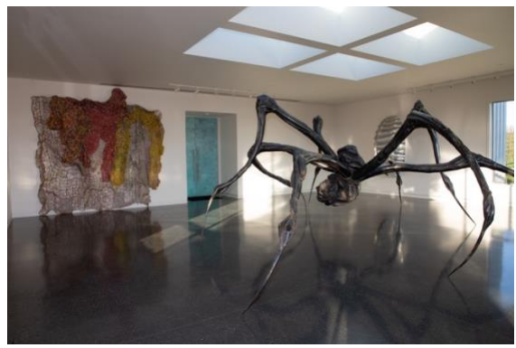
Foreground, Crouching Spider, 2003 by Louise Bourgeois