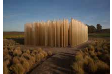
Gao Weigang Maze, 2017