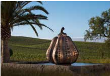
Yayoi Kusama Pumpkin, 2014