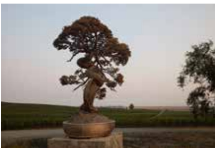
Marc Quinn Held by Desire (The Dimensions of Freedom) , 2017-18