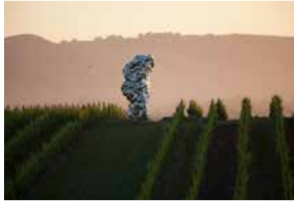
Zhan Wang Artificial Rock No. 126, 2007-13