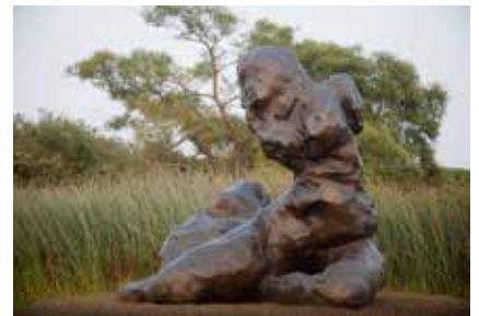
Tracey Emin All I Want is You, 2016