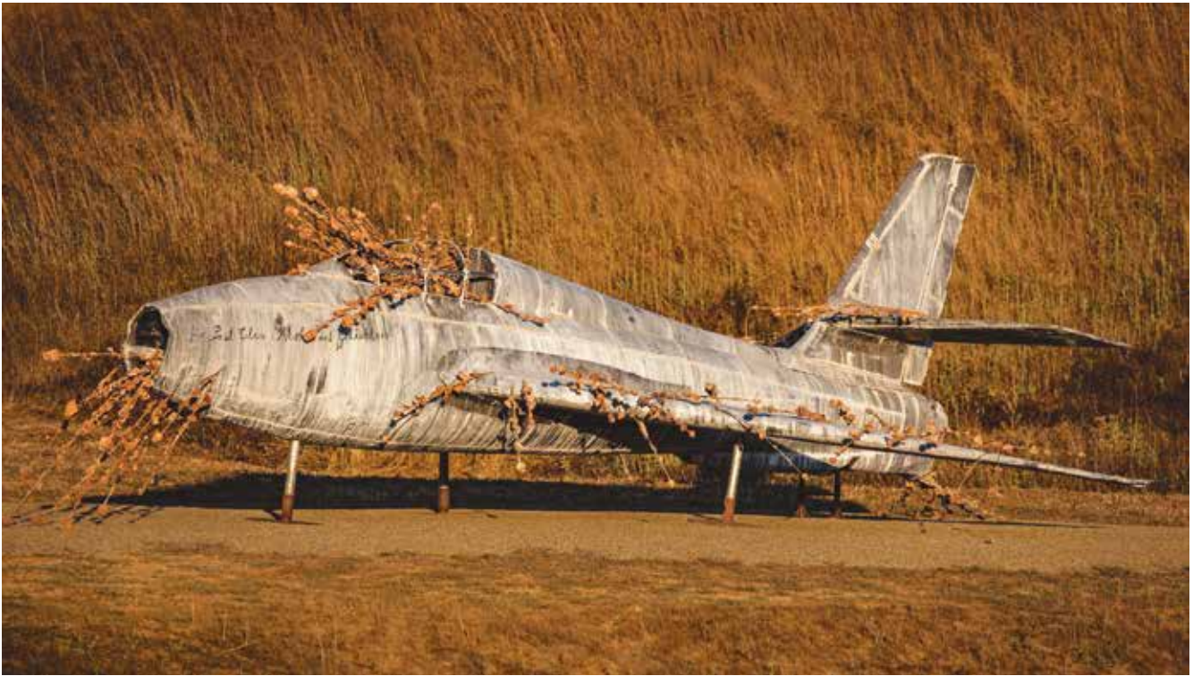
Anselm Kiefer, Mohn und Gedächtnis (Poppy and Memory) , 2017

While the sculpture collection at Donum will grow over time and follows no over-arching theme, various ideas emerge from a sculpture walk through the vineyard: for example, a sense of flowing line that complements the vines; the relationship between man and nature, cultivated land and wild space; questions about the environment, beauty, perception, love and cross-cultural connection, and – above all – the global nature of the art and artists.