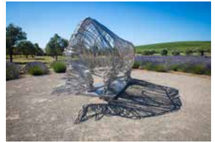
Li Hui Captured Rhino , 2012