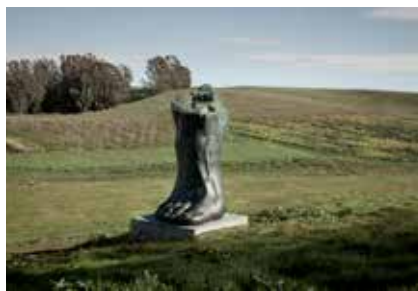
Fredrik Wretman Half Foot , 2017