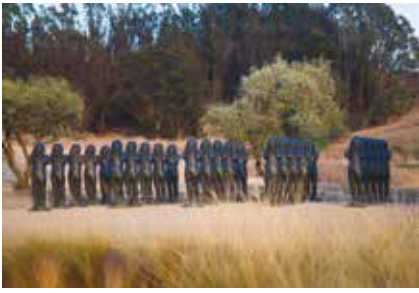
Yue Minjun Contemporary Terracotta Warriors , 2005