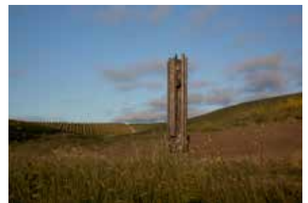
Mark Manders Composition with Long Verticals , 2016