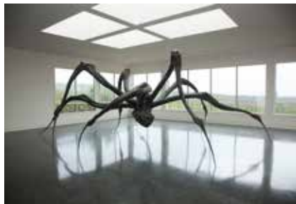
Louise Bourgeois Crouching Spider, 2003