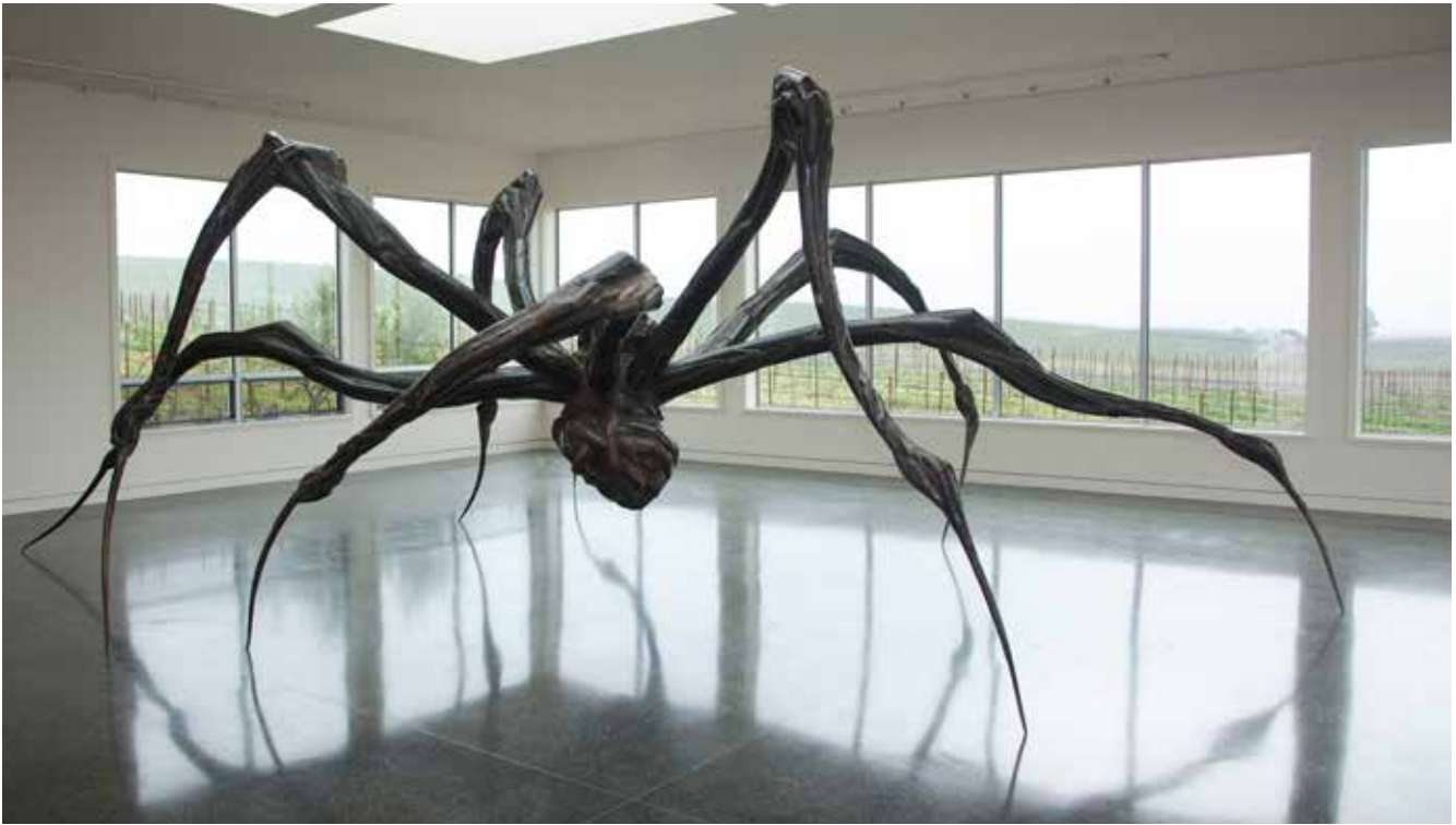
Louise Bourgeois, Crouching Spider , 2003