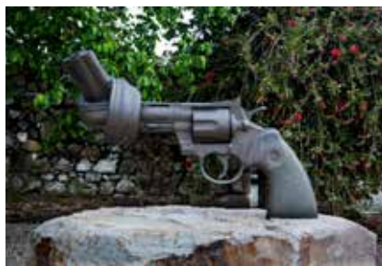
Carl Fredrik Reuterswärd Non-Violence , 1985