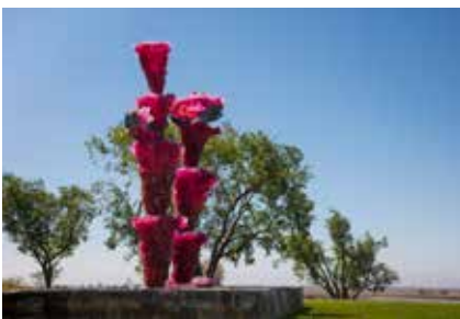
Lynda Benglis Pink Ladies , 2014