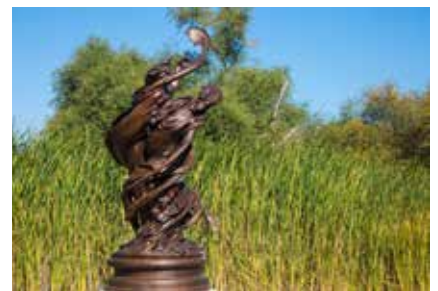
Wim Delvoye Two Bacchantes , 2018