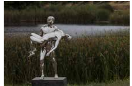
Elmgreen & Dragset The Care of Oneself, 2017