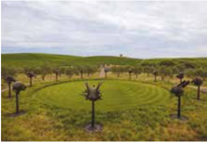
Ai Weiwei Circle of Animals/Zodiac Heads, 2011

For high resolution images of the sculpture collection at Donum, please contact Sarah Greenberg: sgreenberg@evergreen-arts.com