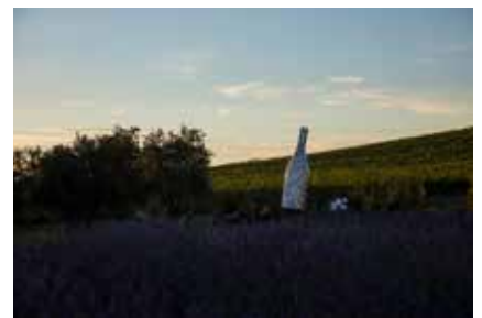
Subodh Gupta Soma, 2016