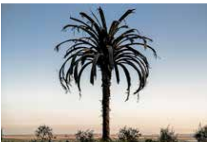
Douglas White Black Palm, 2011