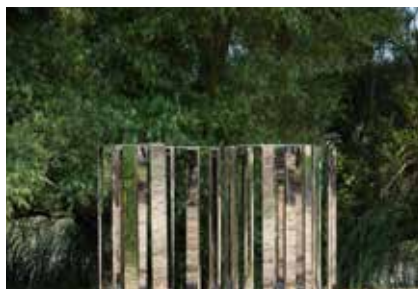
Jeppe Hein One Two Three , 2017