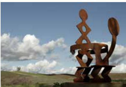
Keith Haring King and Queen , 1987