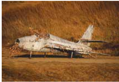
Anselm Kiefer Mohn und Gedächtnis , 2017