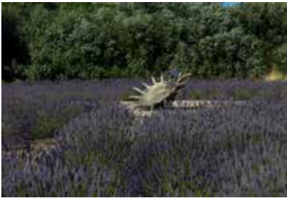
Marc Quinn The Architecture of Life , 2013