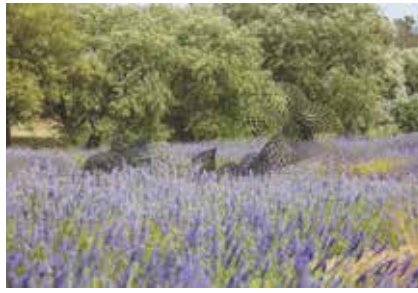
Sopheap Pich Morning Glory , 2017