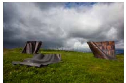
Danh Vo We the People (detail) , 2010-14