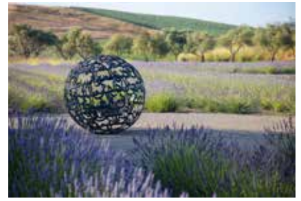
Ghada Amer The Words I Love the Most , 2012