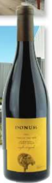
Top: The Tasting Room at the Donum Estate. Contact thedonumestate.com to book a visit; Donum's wine labels feature the art from the estate's sculpture Zodiac Heads (2011) by Ai Weiwei. Above left: Louise Bourgeois' Crouching Spider (2003) is a gigantic sculpture of bronze and stainless steel legs on display within the pavillion; Above right: Yayoi Kusama, Pumpkin (2014) features prominently on the pavillion fountain.

Donum's original vines, as well as those of three other estates, following a vinicultural philosophy that works with nature, not against it. The result is a pinot noir-heavy range of additive-free terroir-expressive, single-vineyard wines crafted by winemaker Dan Fishman that are regularly snapped up by collectors.