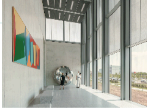
Nameake The new German Würth Forum.

In June, Reinhold Würth opened an annex to his Museum Würth in the German city of Künzelsau. Designed by David Chipperfield Architects, the new extension adds 69,000 square feet, and cost around €30 million ($46 million). The space's inaugural exhibition, "The Long View: Reinhold Würth and His Art Collection," featured some 150 works from his extensive modern and contemporary art holdings. And Würth keeps adding to the collection, which now numbers more than 18,300 objects; he recently scooped up Max Beckmann's 1942 Water Tower in Holland and Roy Lichtenstein's 1994 Metallic Braustrafale Head .