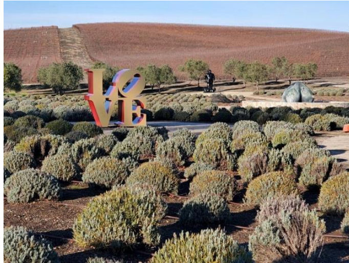
Robert Indiana, LOVE © The Donum Estate